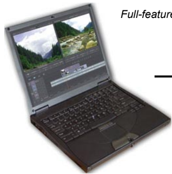
Full-featured software-based NLE for network and on site production

Incite Remote Producer is a full-featured, hardware independent NLE application you can use virtually anywhere for pre-production or even complete production. Incite Remote Producer can edit low bitrate proxy files to create sequences to be finished later by Incite on-line applications or high bitrate files using software codec to build and finish projects in the field or on-site. Without any dedicated hardware, sophisticated effects can be created using Incite filters and plug-ins for CPU-processed effects, rendering these effects in the background or on the network. Incite Remote Producer can access shared media via Ethernet on central storage and deliver pre-production projects to Incite high-powered on-line systems like Incite Editor Studio/Suite and Incite HD Suite .