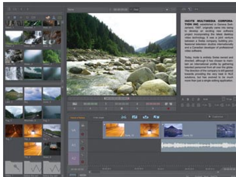
Software-codec, EDL editor designed for the newsroom journalist

Incite Newsmaker is a streamlined, software-codec EDL editor designed to create simple sequences using low bitrate proxy video files and delegate the finishing job to an on-line Incite station that will automatically use high resolution files without any need to recapture. Designed around the needs of the newsroom market and IT environments, Incite Newsmaker has open tools to tie in to existing automation and play out solutions. Not only is Incite Newsmaker an easy to use simple-cuts editor, it also provides the tools journalists need to create and edit their scripts, with the added ability to let them record voice-overs at professional quality. All of this is built around Incite's dynamic and transparent clip/timeline architecture, letting journalists prepare their stories for senior editors who will finish the project on Incite News or Incite Editor Studio/Suite .