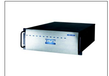
Incite HD Suite powered by DVS hardware

Incite's HD-resolution editing system for the ultimate in video and film-resolution finishing built on DVS hardware. Incite HD Suite provides HDTV standards 720p, 1080p and 1035i/1080i, support for 24p editing and can use both 8-bit and 10-bit color depths for maximum image quality. The system can be used both as a remote HD recorder and a local HDTV edit station with complete connectivity on the SAN. Incite's dynamic clip architecture and project transparency lets you initially prepare projects and sequences in editing applications like Incite Remote Producer and Incite Editor Studio/Suite and then finish the production in Incite HD Suite for the ultimate fidelity in video quality and image detail: fast-action sports programs, stunning life-like documentaries, and even full length feature film and fiction production are all within your grasp.