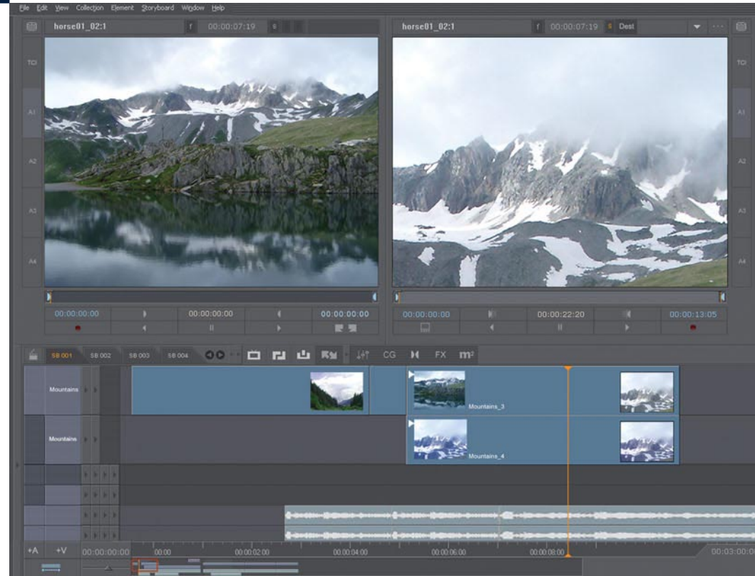
Incite's state-of-the-art editing application for post-production and promo